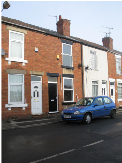
External view of property